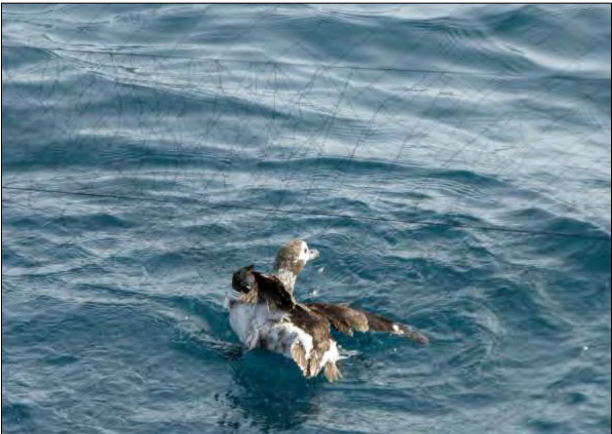
Figure 3. Female long-tailed duck entangled in overwater mist net in Lake Michigan, April 2015.