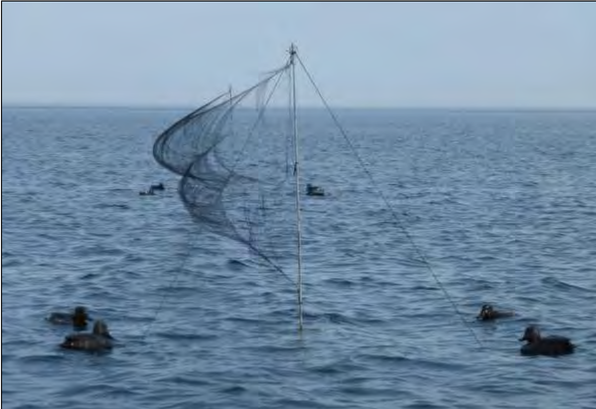
Figure 2. Mist-net overwater set for sea ducks on Lake Michigan, April 2015.