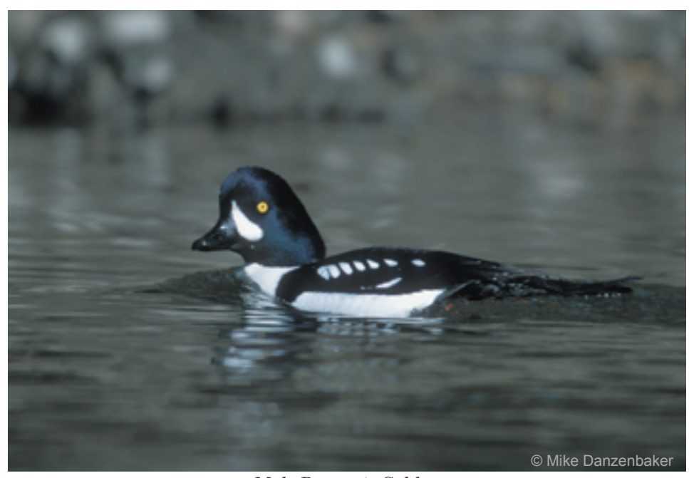
Male Barrow's Goldeneye

The breeding range of Barrow's goldeneyes is generally restricted to areas west of the Rocky Mountains from Montana to Alaska, and to a core breeding area in the east on the high plateau along the north shore of the St. Lawrence estuary and gulf. There is no evidence of exchange between the eastern and western populations.