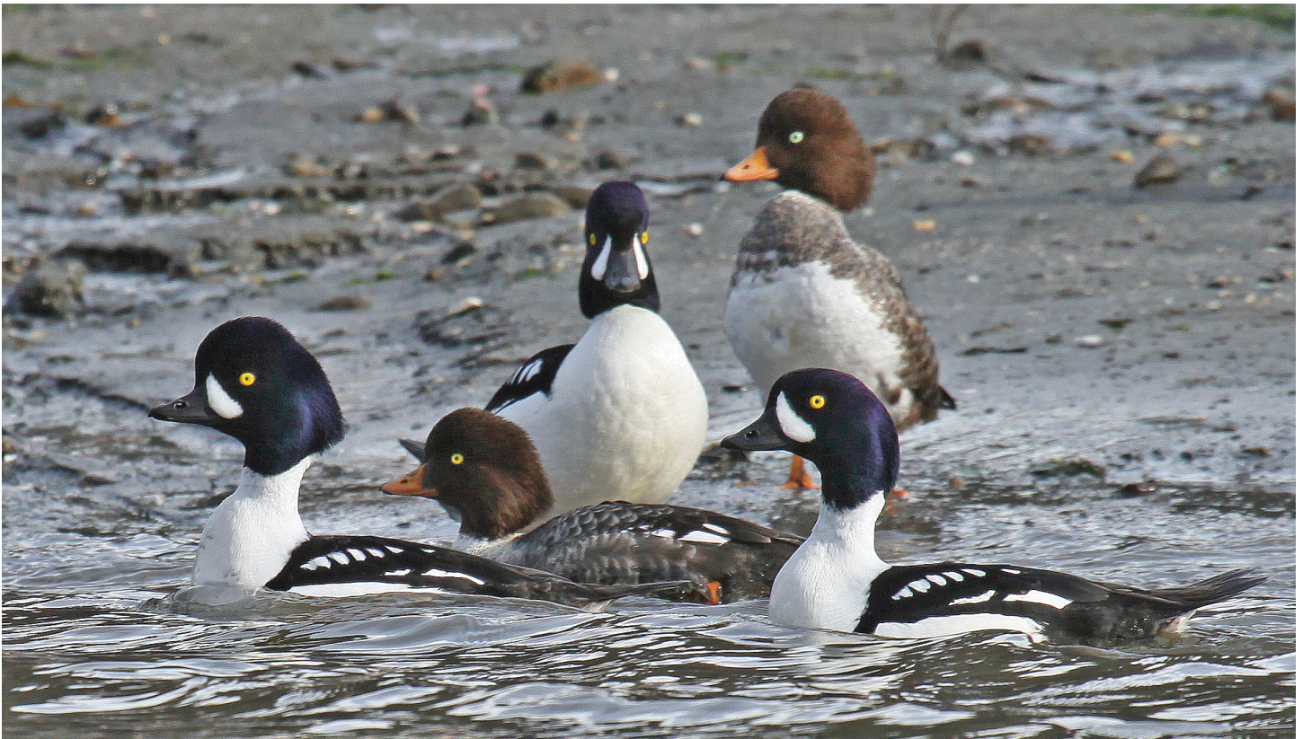
Barrow's Goldeneyes.