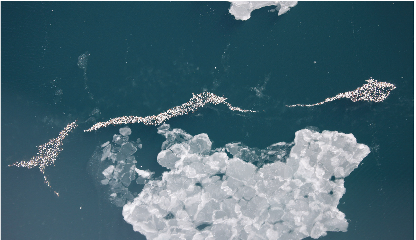
Common Eiders wintering in sea ice.

Troutet, Y., and C. Samson. 2015. Situation de la population nicheuse d'Eiders à duvet dans les forêts de la réserve de parc national de l'Archipel-de-Mingan en 2008. Parcs Canada, Unité de gestion de Mingan. 22 pp.