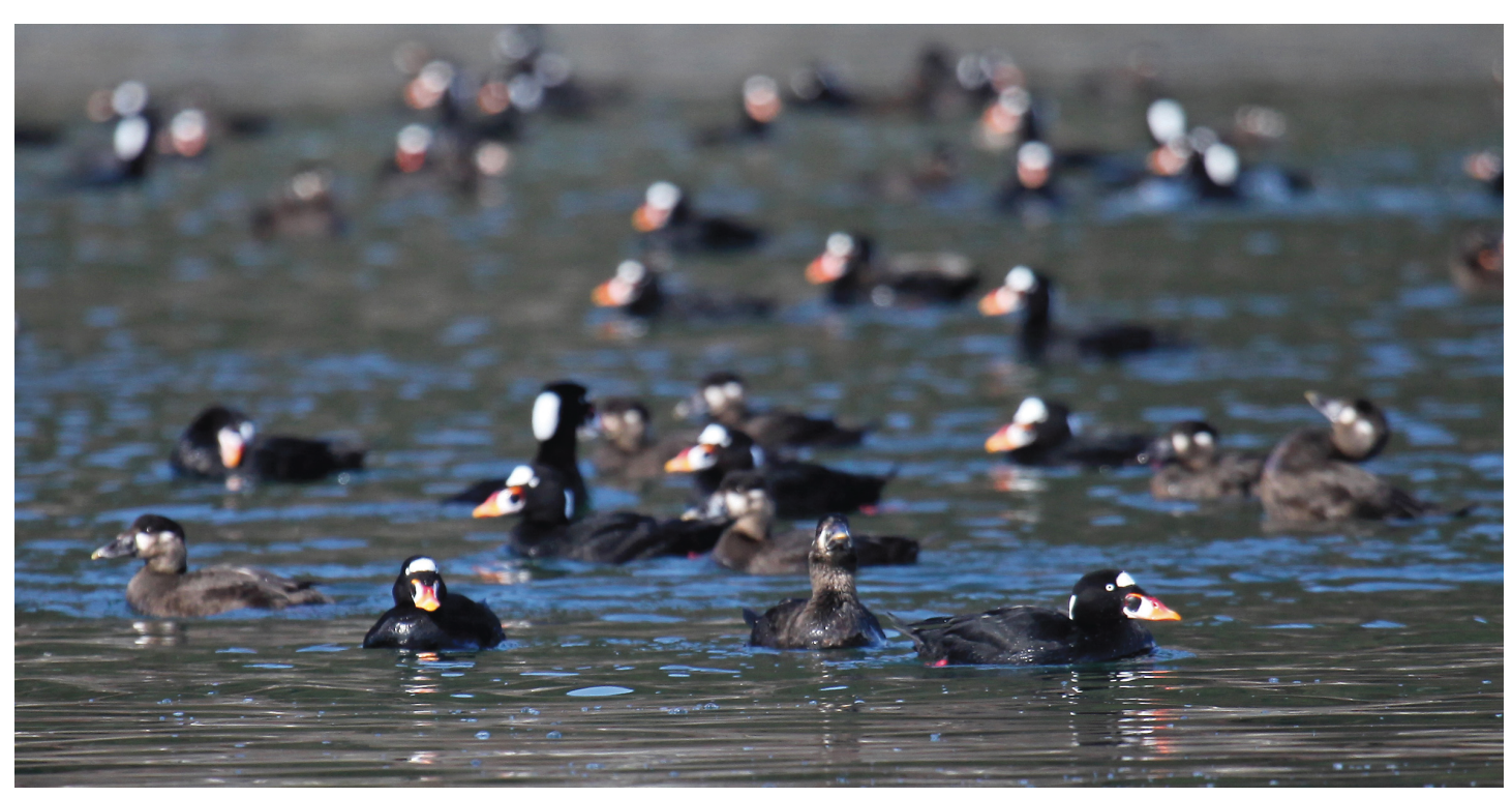
Surf Scoters.