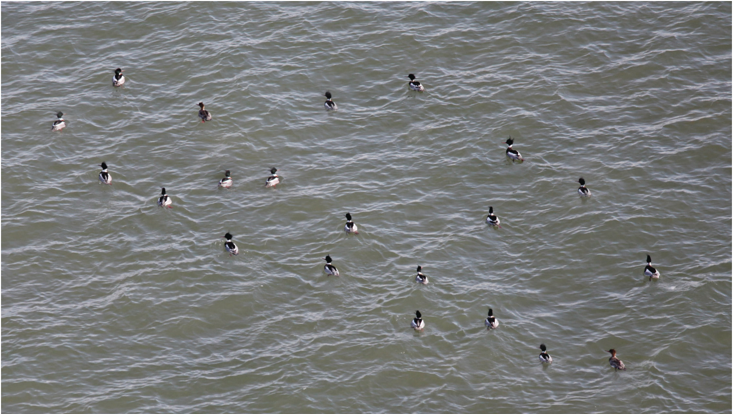
Red-breasted Mergansers.