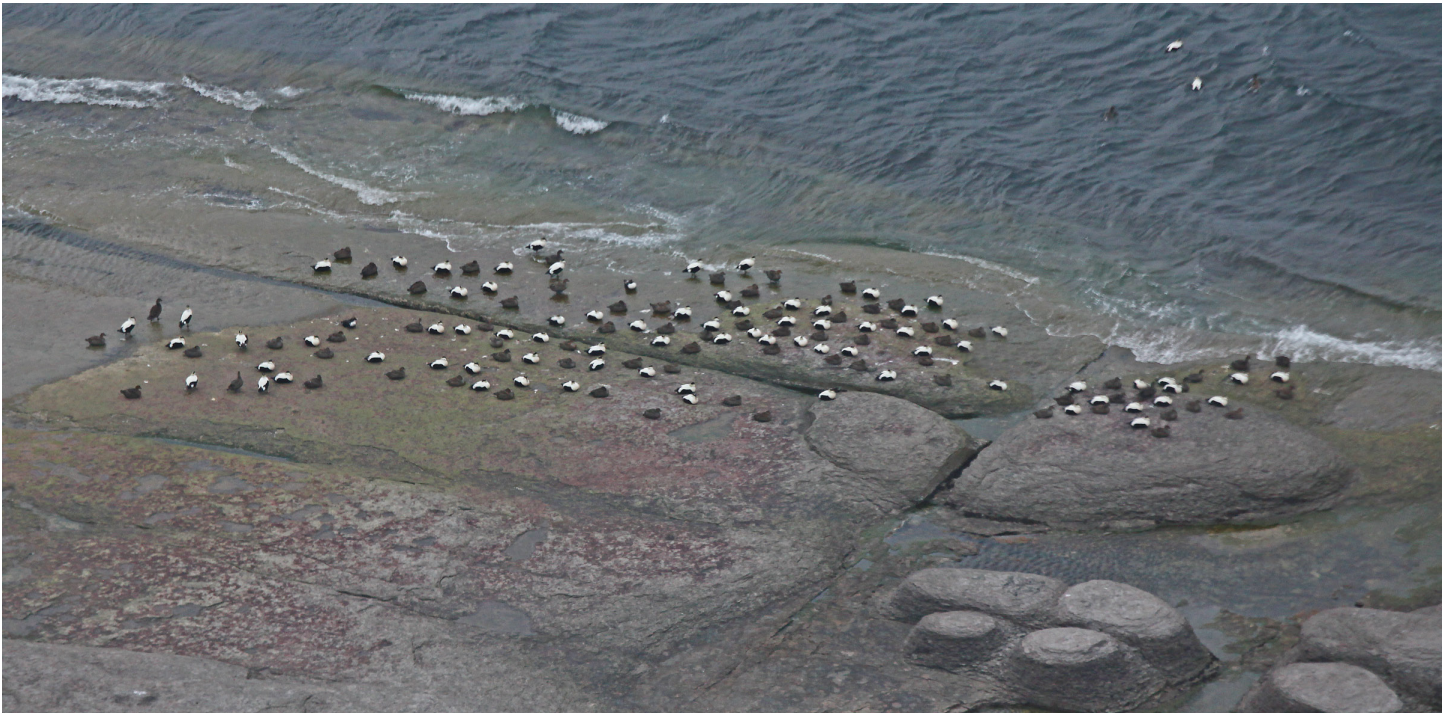
American Common Eiders roosting.