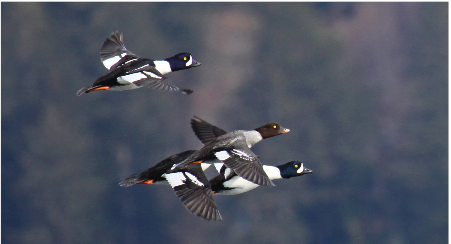
Barrow's Goldeneyes.