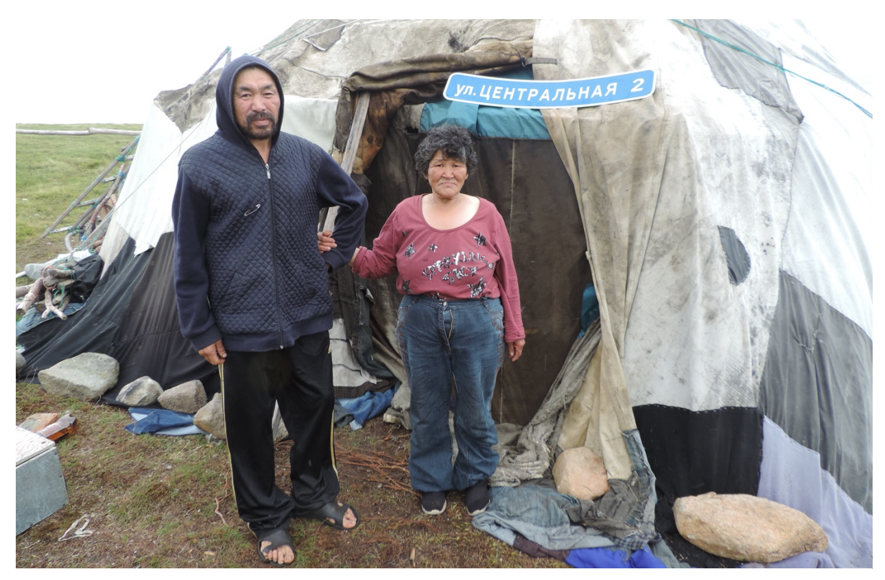
Figure 3. An interviewed hunter and his wife outside their summer yaranga near Kanchalan, Chukotka