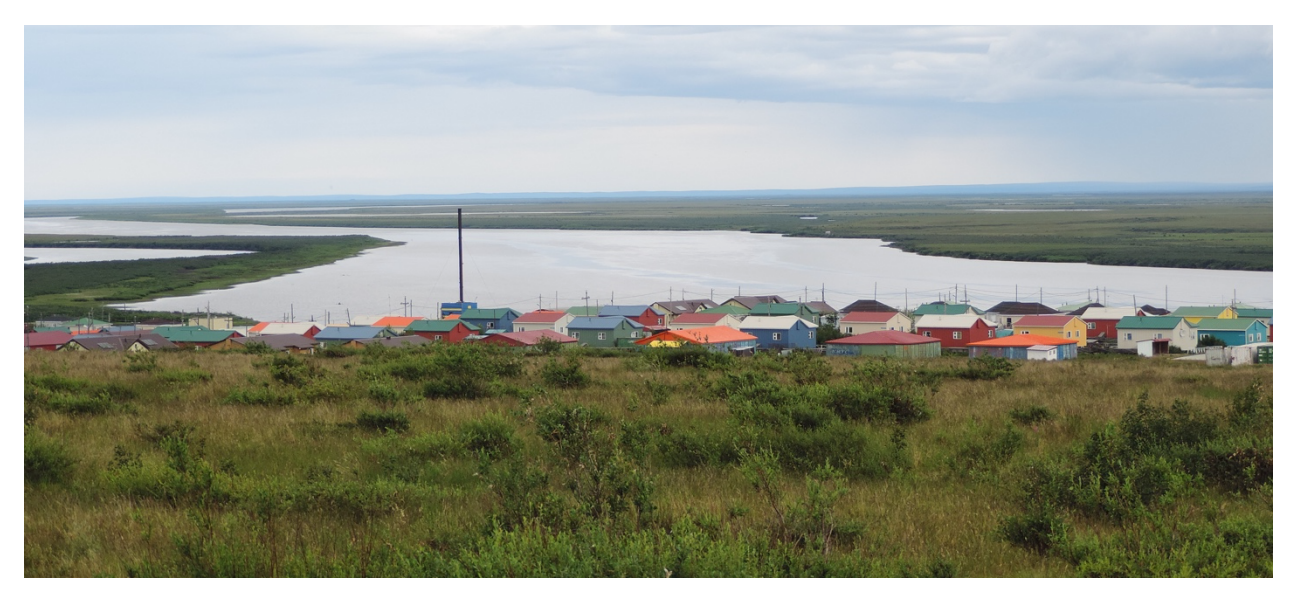
Figure 2. The Village of Kanchalan, Chukotka

we are happy to have made as much progress as we have, and to be moving into the full implementation of the survey tool.