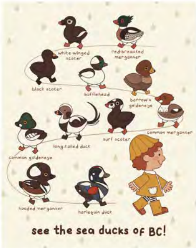
SEE BC SEA DUCKS by Chloe Lemay