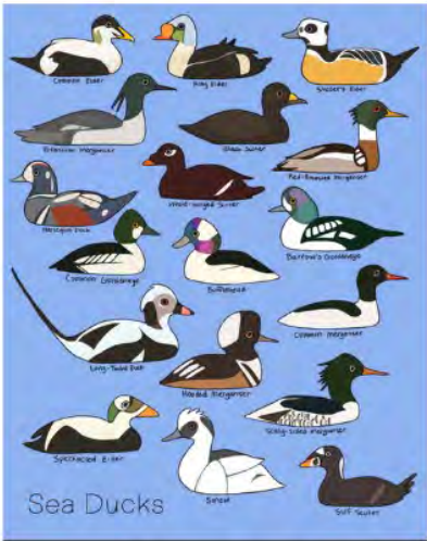
SEA DUCKS by Jacey Wall