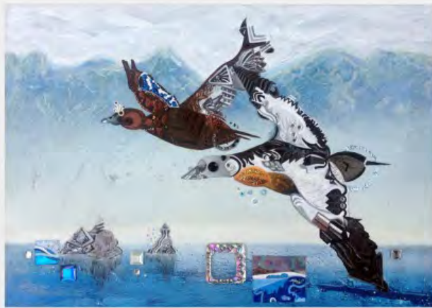
Steller's Eider