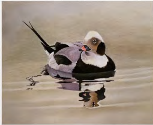
Long-tailed Duck by Raymond Easton