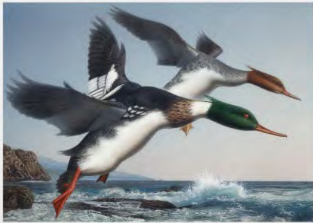
Red Breasted Merganser at Point Lobos