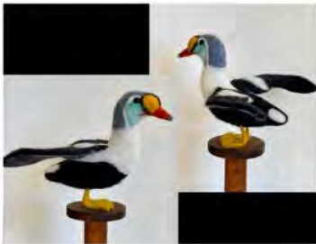
King Eider