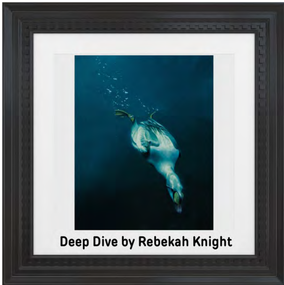
Deep Dive by Rebekah Knight